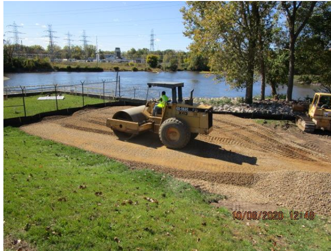
Construction of laydown area at Morrow Dam

Construction mobilization activities are complete and all major equipment for the gate replacement is onsite.