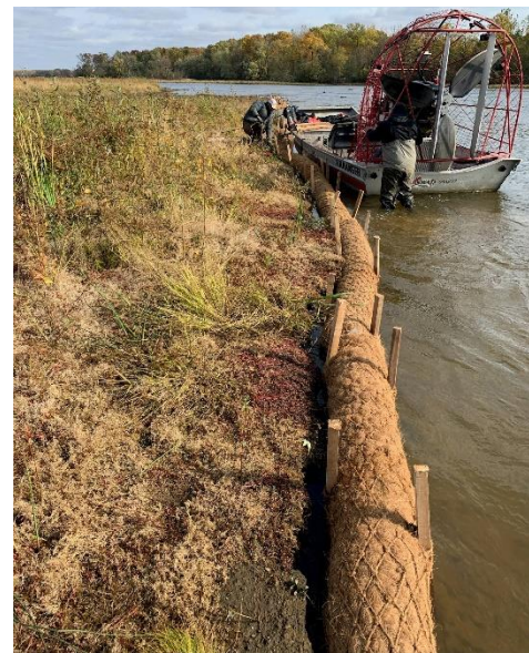
Fiber coir logs installed along bank in Morrow Lake

STS Hydropower has made commitments to the Michigan Department of Environment, Great Lakes, and Energy (EGLE) to assess and appropriately mitigate impacts to aquatic resources resulting from the emergency reservoir drawdown. STS Hydropower is currently working with EGLE to finalize a draft Field Investigation Plan (FIP). The Plan describes the activities that STS Hydropower proposes to conduct in Fall 2020 to assess the volume, location, depth, and composition of sediments downstream of the dam that were mobilized by the drawdown of Morrow Lake. STS Hydropower is currently conducting a bathymetry survey (survey of the river bottom) downstream of the dam.