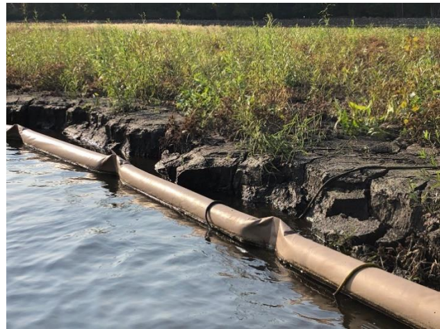
Shoreline protection installed along bank in Morrow Lake

STS is actively managing sediment transport downstream of Morrow Dam. As of November 12, 2020, a total of 8,350 feet of sediment control measures have been installed upstream and downstream of Morrow Dam (5,900 feet of shoreline containment and 2,450 feet of permeable containment checks). Two hundred (200) feet of coir logs have been installed upstream of Morrow Dam to stabilize the eroding shoreline. Based on current data from turbidity monitors installed upstream and downstream of the dam, the current sediment control measures are having a positive effect on the ongoing sediment transport and turbidity issues.